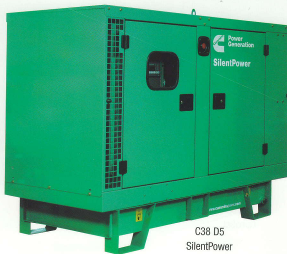
C38 D5 SilentPower