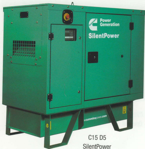
C15 D5 SilentPower